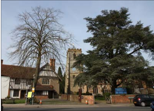
Knowle Parish Church and Guild House.

Knowle Local History Society meetings are normally held in Knowle's early 15th century Guild House, the glorious timber-framed building next to the church, or occasionally meetings are in the church. Both are in The Square at the heart of the village at the south end of High Street. Exhibitions in Knowle are shown at Knowle Library, a timber-framed building with two gables in the centre of High Street, approached from a rear courtyard.