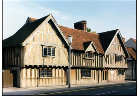
Knowle Library (Chester House)

Knowle lies on the A4141 (formerly A41) about 3 miles south of Solihull, 1 mile from the M42 (J5) and 10 miles from Warwick. The nearest railway station is at Dorridge. Buses from Solihull stop at Knowle every half hour. There are stops outside the church, one opposite and at Knowle Green on the corner of Station Road.