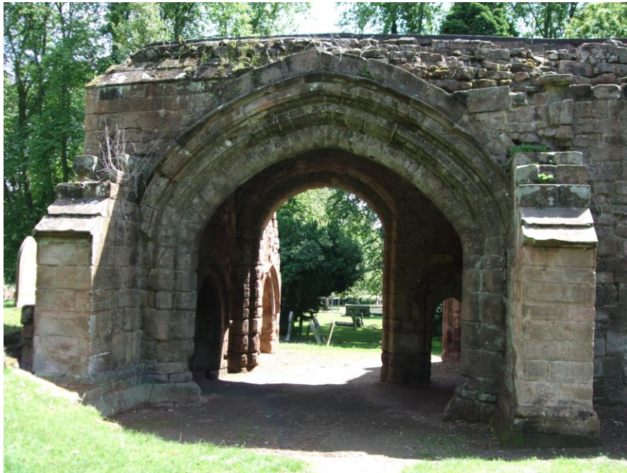
The vaulted passage of the Gatehouse today