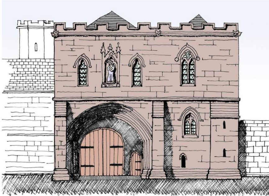
The Gatehouse as it might have appeared in the Middle Ages