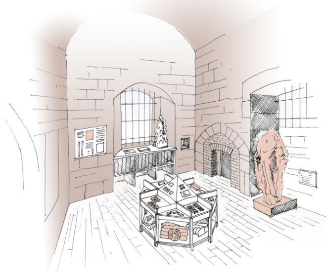
The outer chamber, with the central octagonal display unit

Currently the Gatehouse chambers are used as a store, and shelving conceals much of the architectural detail. These drawings by Jonathan Holland give an impression of how the chambers could look after the completion of the project.