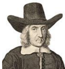
William Dugdale 1605-1686

Cancellations and a full refund will be possible with two weeks’ notice.